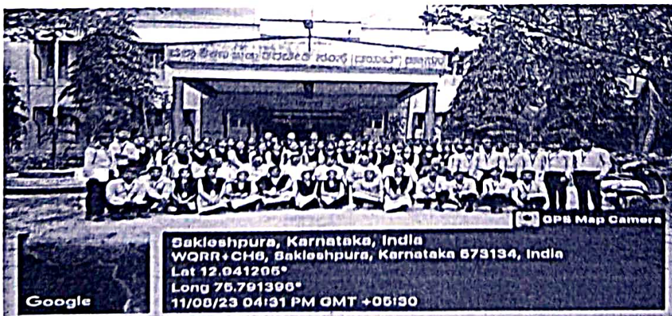
FIRST YEAR B.Ed STUDENTS GROUP PHOTO WITH DIET STAFF

"The concept of a National System of education implies that, up to a given level, all students, irrespective of caste, creed, location or sex, have access to education of a comparable quality says the NPE. It goes on say "to promote equality, it will be necessary to provide equal opportunity to all not only in access, but also in the condition for success".